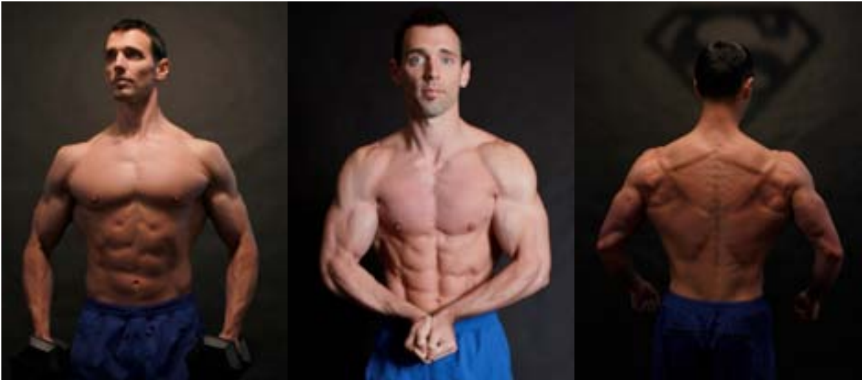
BEFORE BACK AFTER BACK